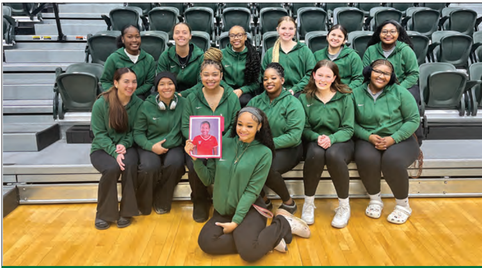
Group photo of the Delta Devilettes' Softball team