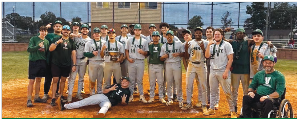
Group photo of the Delta Devils' Baseball team