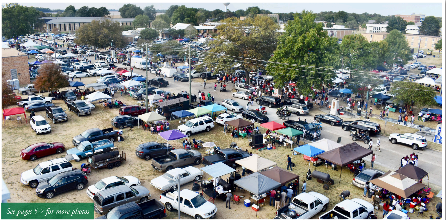
See pages 5-7 for more photos