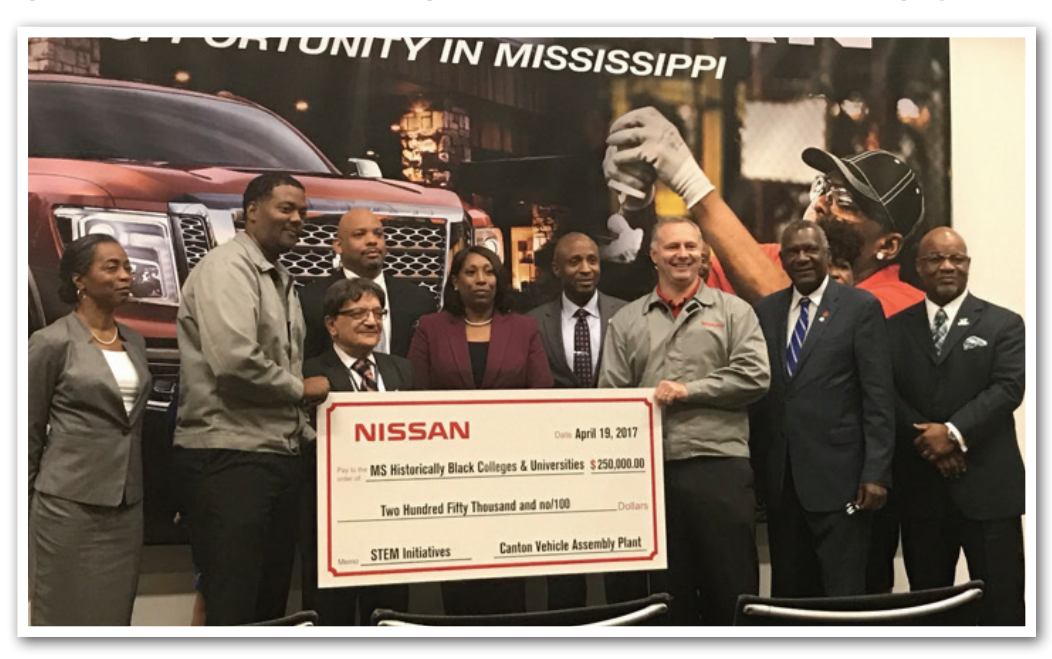
HBCU Presidents and other leaders receive a $250,000 donation.

The donation of $250,000 builds on the success of Nissan Canton's ongoing partnership with