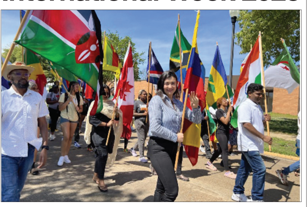
Parade of Flags: MVSU students, faculty and community came together in celebrating world culture.