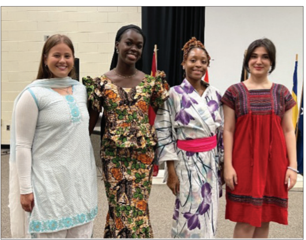
Fashion Fiesta - Global Runway organized as part of the 2023 International Week showcased clothes from around the world.