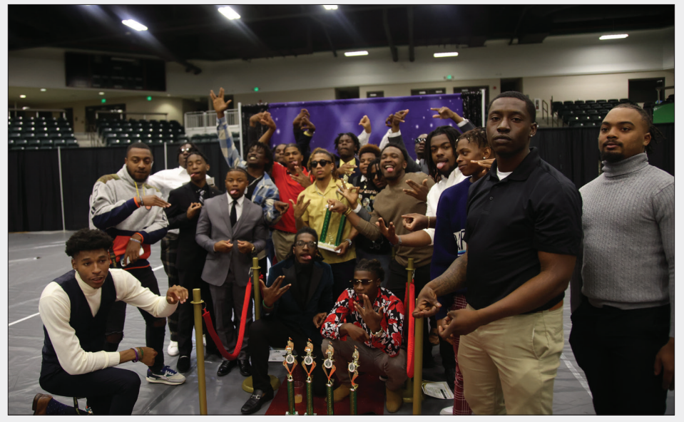
The MVSU Marching Band's Drumline.