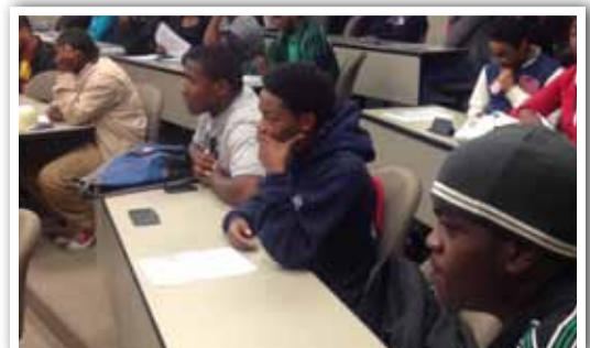
MVSU students engaged in symposium discussion