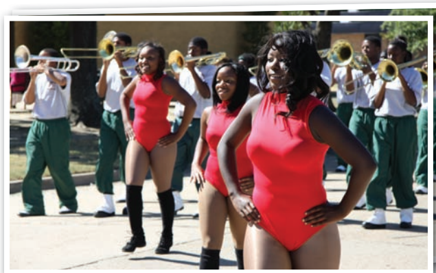
The Satin Dolls lead the Mean Green Marching Machine in the 2010 Homecoming Campus Parade.