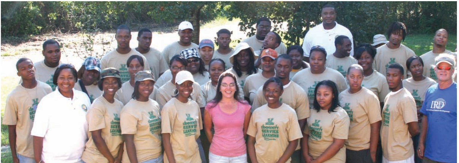
The group of student volunteers take a moment for a photo upon the completion of their three-day visit.