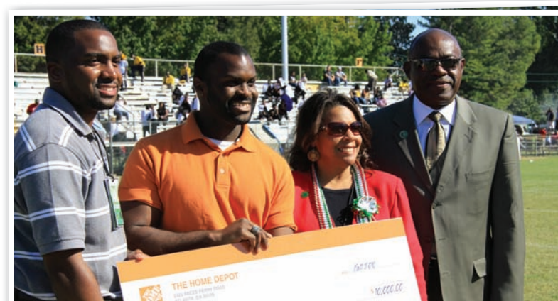
A check presentation from the Home Depot Retool Your School Program was presented to add nearly 200 ADA uniform signs through the campus.