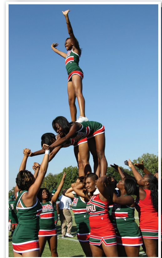
MVSU Cheerleaders build a pyramid during the football game.