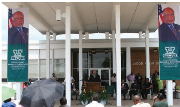
MVSU celebrates the unveiling of the Congressman Bennie G. Thompson Student Plaza.

“Congressman Thompson has devoted so much of his time and resources to higher education in the state of Mississippi and especially in the Delta. We felt that it is only befitting that we honor him. He is a trailblazer in