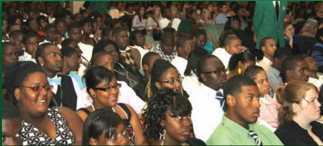
The Class of 2014 await their chance to be inducted into the MVSU family.