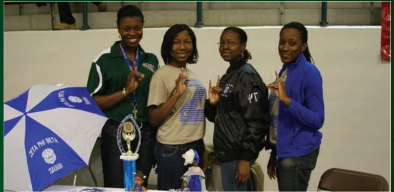
Members of Zeta Phi Beta pose at the Founder's Pep Rally.